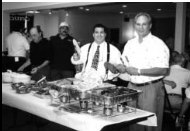
A full crowd and of course plenty to eat. One of Touro's signatures.

Thus, the last lodge meeting of the year concluded on a very high note. We look forward to what the Social Committee will plan for next year's Steak Fry.