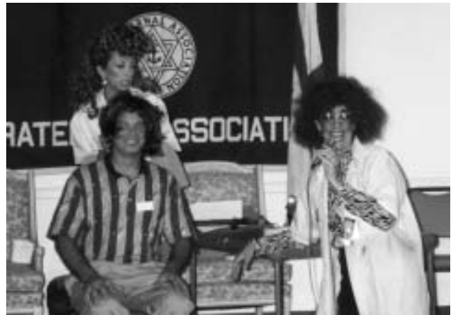
A willing participant?

Can you find another somewhere in this issue?