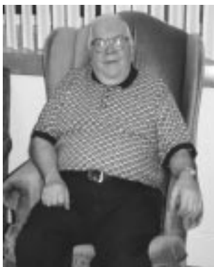
The Conscience of Touro page 3