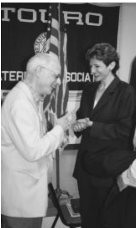
Guest Speaker, Financial Advisor, Jill Schlesinger