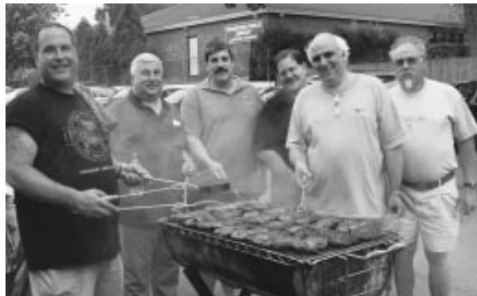
Chefs galore at our Annual June Steak Fry