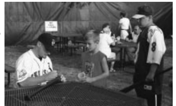
Touro goes to the Pawsox