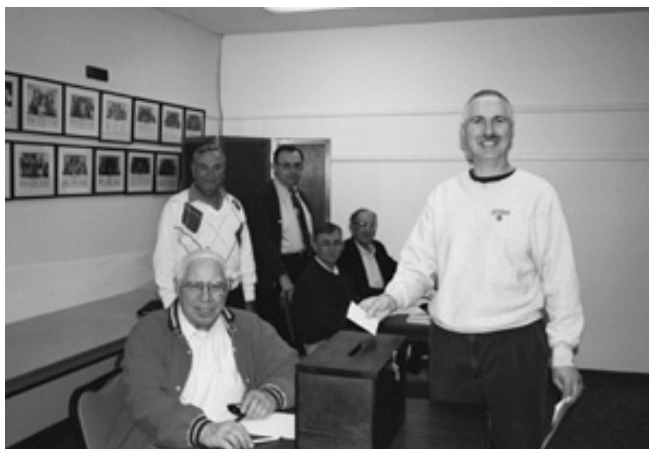
Cast your vote – as many Touro members did on the night of May 2nd.