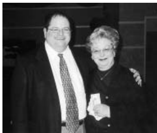
Show me the money.

Just another Touro contribution to our community.