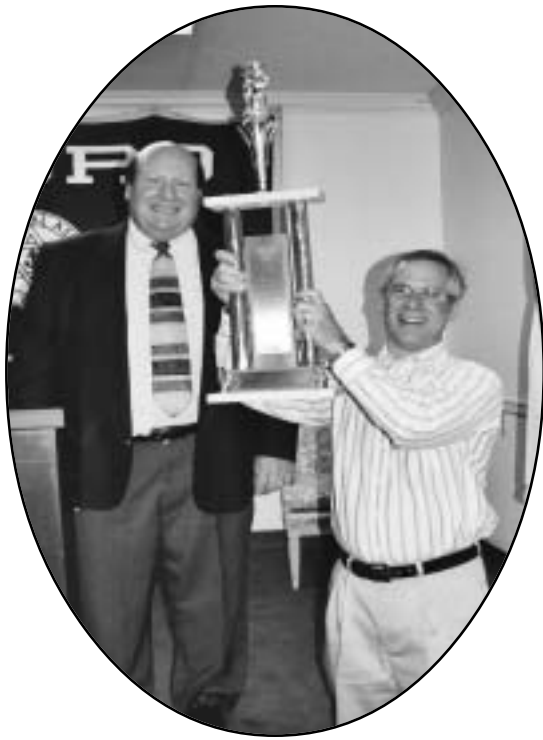
Friendship Lodge Wins the Trophy