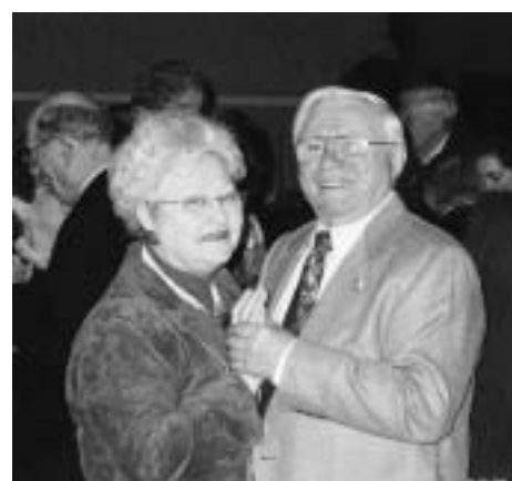
A little two-step at the two-fer.